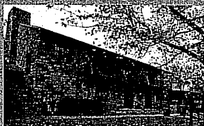
The lodge was completed in 1936.

For details about the park, call (618) 457-4836, or visit www.dnr.state.il.us . For reservations in the lodge, call (618) 457-4921. ●